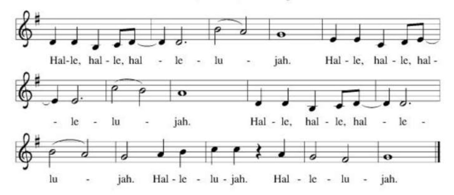
GOSPEL: Luke 5: 1-11

The holy gospel according to Luke. Glory to you, O Lord.